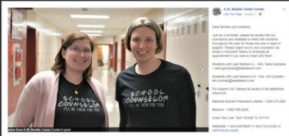
Social Media posts to remind students and parents that counselors are available as well as provide crisis lines.