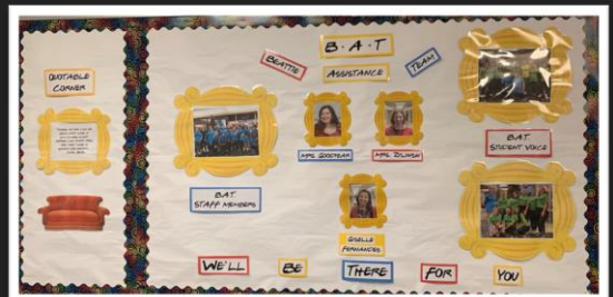
Introduce your SAP team & supports to the school.